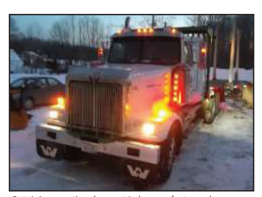
Retaining a national expert in human factors who specializes in the operation of motor vehicles and drivers' night vision helped us win our case.

to our filing a lawsuit. After all, the trailer was supposedly there to be seen and it was, they maintained, our client who had crashed into the trailer. The Defense's response to our lawsuit was predictable: our client must have been driving too fast; she must have been distracted; she must have seen the trailer; and thus her claim is barred by her own fault. Relying on what we had learned from both the police investigation and our private investigation, we initially hired an accident reconstructionist and a trucking expert to better understand what had happened in an effort to confirm our initial analysis of the truck driver's negligence. He made an